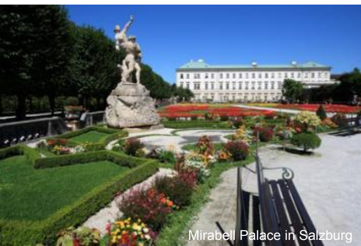
Mirabell Palace in Salzburg

Seminar on the German culture and the everyday life. Get to know the European way of life and European manners. Exercise the German language through common phrases.