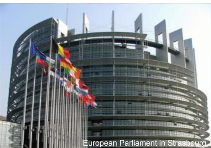
European Parliament in Strasbourg

Seminar on the German culture and the everyday life. Get to know the European way of life and European manners. Exercise the German language through common phrases.