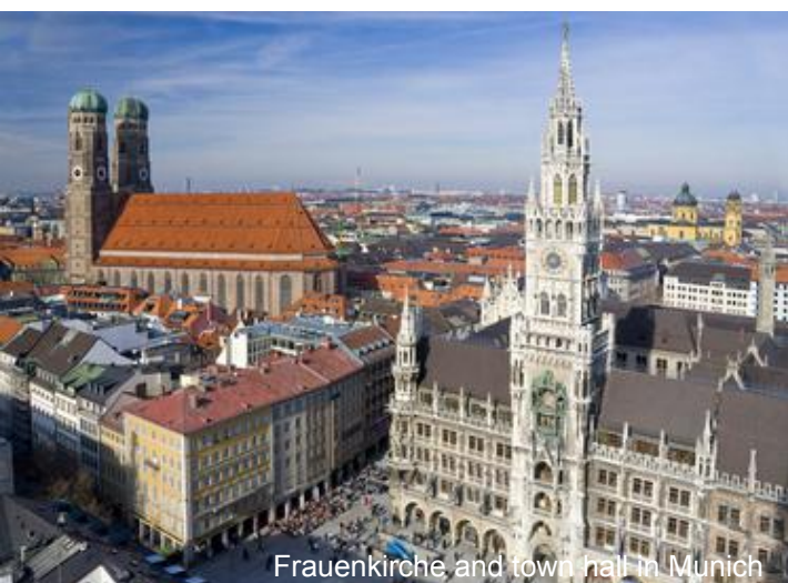
Frauenkirche and town hall in Munich

A traditional and modern house, situated at a mountain lake, surrounded by scenic mountains in the middle of the Berchtesgaden national park in the South of Germany, next to the border to Austria. Located 850 metres high, it has hiking trails leading from the guest house to alpine cabins at the mountain. The lake is clear and clean and offers a chance to cool off in the summer days. Here students and youth from different countries come together for international encounters, common leisure activities, sport activities and language exchange.